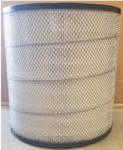
Pre Test Photo - Front